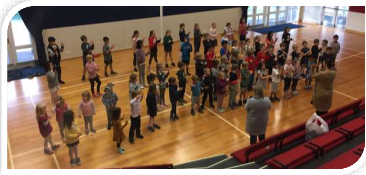
And some of the older students learning how to use our new Poi!